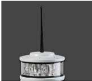
Bird spike Bird spike with thread to be installed in the center of the lantern top.