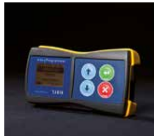
Sabik Easy Programmer User friendly and compact wireless two way programmer.