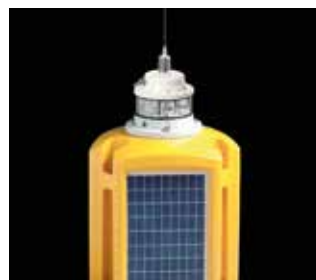
AIS Option Lantern can be equipped with integrated AIS transponder type 1 or type 3