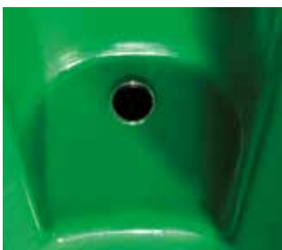
Installation Mounting holes with metal inserts.