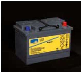
VRLA Battery Maintenance free lead acid battery with a designed lifetime of 7 years.