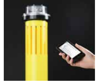
Programming and control Lantern can be programmed and battery status controlled also with an advanced Bluetooth® app for android and IOS mobile phones.