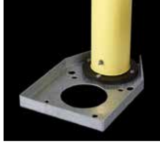
Mechanics Special mechanics suitable for different types of floats available.