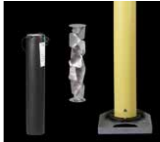
Battery and radar reflector 220 Ah primary battery and radar reflector integrated in the marking light.