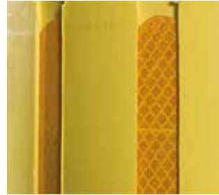
Light reflectors External reflectors in the upper part of the buoy.