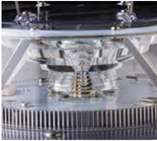
Lens Sabik designed optics with polycarbonate lens.