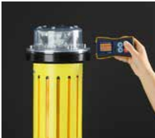
Programming and monitoring Lantern can be programmed and battery status monitored with the Sabik Easy Programmer.