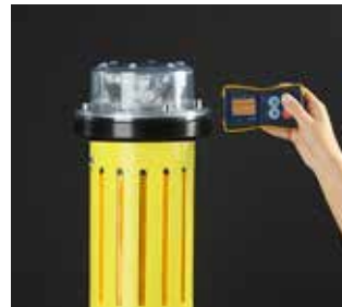
Programming and monitoring Lantern can be programmed and battery status monitored with the Sabik Easy Programmer.