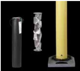
Back-up Alkaline battery and radar reflector 220 Ah primary battery and radar reflector integrated in the marking light.