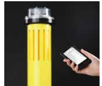
Programming and monitoring Lantern can be programmed and battery status monitored also with the Sabik Bluetooth application.