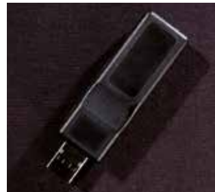
Programming with PC Using Sabik USB interface.