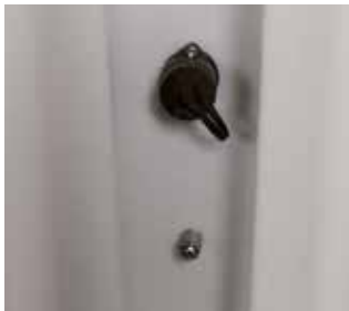
Auxiliary connector (Optionally) enables external charging or additional solar modules.