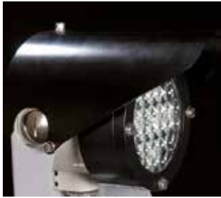
Aluminium housing Rugged housing with sunshield.