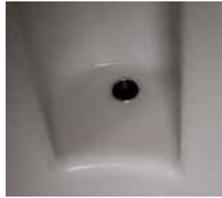
Installation The bottom plate of the SC-LS100 supports installation on structure using 3 x M10 bolts on a 330 mm radius.