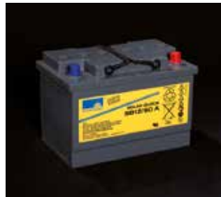
VRLA Battery Maintenance free Lead acid battery with a designed lifetime of 7 years.