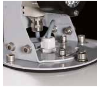
Adjustable Field adjustable in both horizontal and vertical direction.