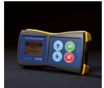
Sabik Easy Programmer User friendly and compact wireless two way programmer.