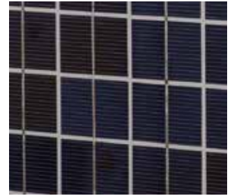
Solar Modules Solar modules with tempered glass front well integrated with the PE-housing.